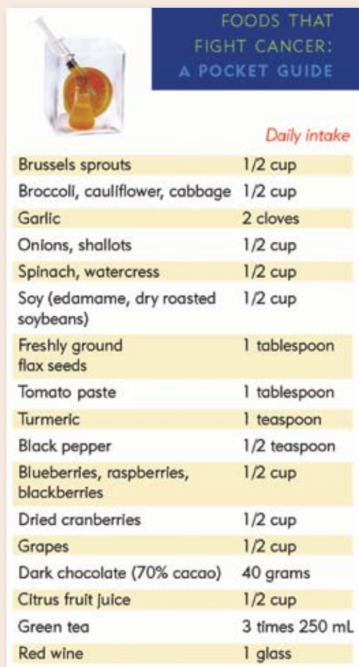
Figure 2. Including foods with chemopreventive properties in a daily diet

A large number of epidemiologic, animal, and laboratory studies indicate that abundant consumption of food of plant origin reduces the risk of several types of cancer. The chemopreventive effect is related to the high content in these foods of phytochemicals with potent anticancer and anti-inflammatory properties. These properties block precancerous cells from developing into malignant cells by interfering directly with tumour cells and by preventing generation of an inflammatory microenvironment that would sustain the progression of the tumours. In many cases, these anticancer phytochemicals interfere